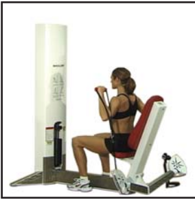
Seated Back Off Pad One Arm Shoulder Press