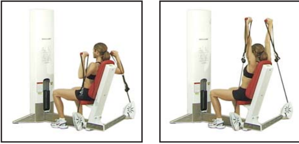
Seated Alternating Arms Shoulder Press